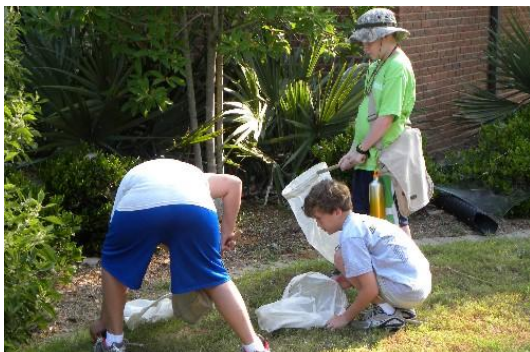
Junior Rangers collecting insects

So, when did you last climb a fire tower? Twenty-seven Junior Rangers did in June at Noxubee National Wildlife Refuge while attending the Friends of Noxubee Junior Ranger Camp. Rangers learned to spot forest fires as one of the camp activities. The campers enjoyed a week of day long programs in the camp funded by Wilson Conservation Trust, MSU Wildlife, Fisheries, and Aquaculture Department, Noxubee NWR,