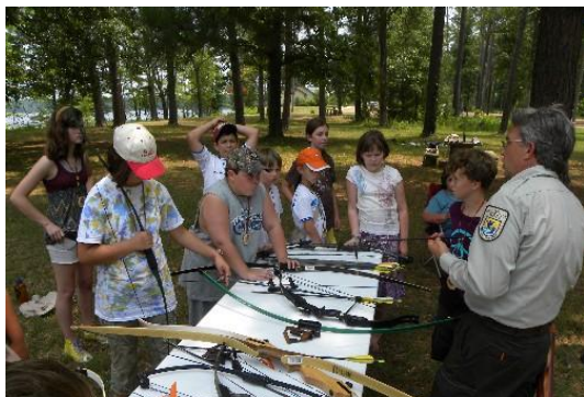
Junior Rangers examining different bow types

Each day included classroom sessions with hands on opportunities for campers interspersed with physical activities. The classroom sessions included storytelling, presentations on skulls, horns, and antlers, archaeology and ancient culture of the refuge, feathers, armadillos and leprosy, non-point source pollution, and weather forecasting.