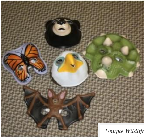
Unique Wildlife Masks available now at the Nature Store